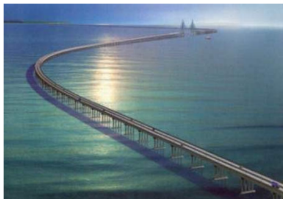
Building Bridges... Our Faith, Our Future!

For further information and to register, visit - http://www.tjdistrict.org/events/tjd2011annualmeeting.html